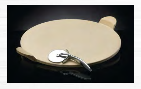
PRO PIZZA STONE AND CUTTER 70001