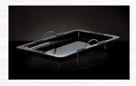
GRILL ROASTING PAN 56055