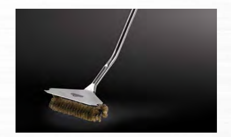
BRASS BRISTLE WIDE BRUSH 62056