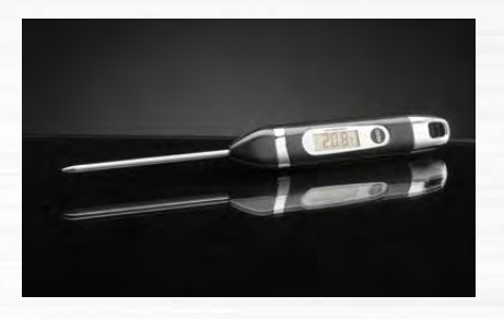
DIGITAL THERMOMETER 61010