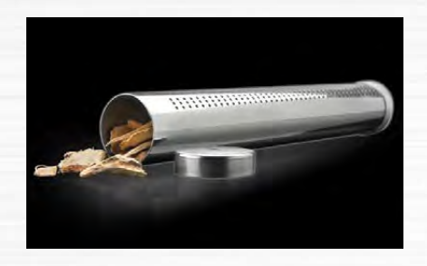
SMOKER TUBE 67011