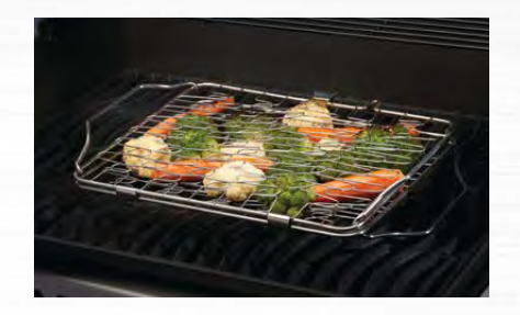
FLEXIBLE GRILL BASKET 57012