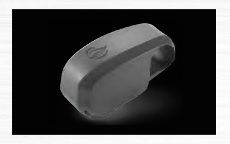
GRILL LIGHT 70049