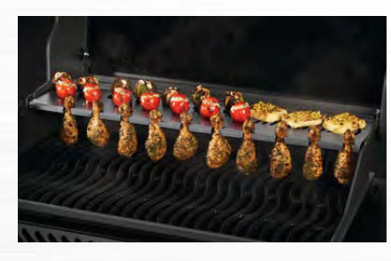
MULTIFUNCTIONAL WARMING RACK 71501/71502/71503