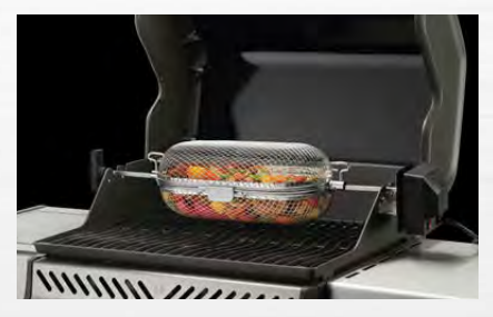
ROTISSERIE BASKET 64000