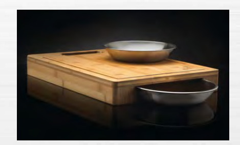
PRO CUTTING BOARD WITH SET OF 2 STAILESS STEEL BOWLS 70012