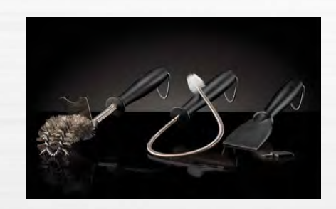
GAS GRILL CLEANING TOOLSET 62045