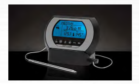
WIRELESS DIGITAL THERMOMETER 70006