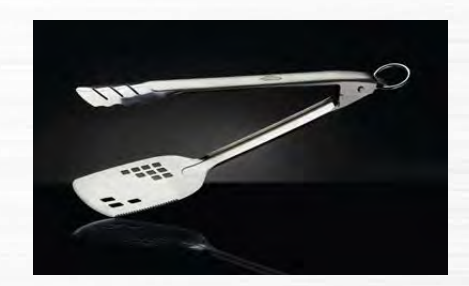
PRO SPATULATONG 55019