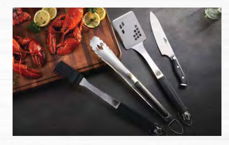
PRESIDENT 4 PIECE TOOL SET 70037