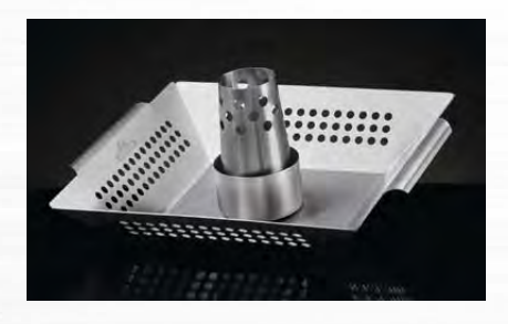
BEER CAN CHICKEN ROASTER WITH TOPPER 56024