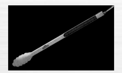
STAINLESS STEEL LOCKING TONGS 55015