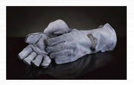
GENUINE COWHIDE LEATHER GLOVES 62147