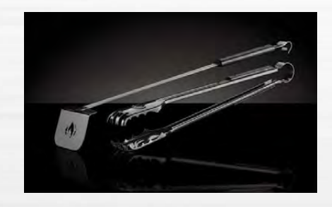
CHARCOAL RAKE AND TONGS 67740