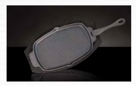
CAST IRON SIZZLE PLATTER 56003