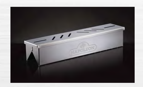
ROGUE PRO SMOKER BOX 67013