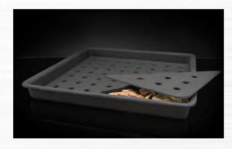
CAST IRON CHARCOAL TRAY 67732