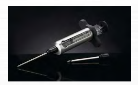
MARINADE INJECTOR 55028