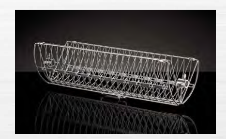
ROTISSSERIE RACK 64005