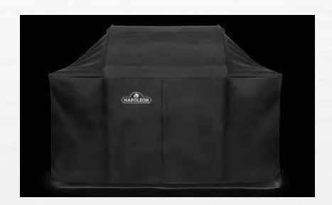
GRILL COVERS FOR ROGUE SERIES 61365/61427/61527/61627