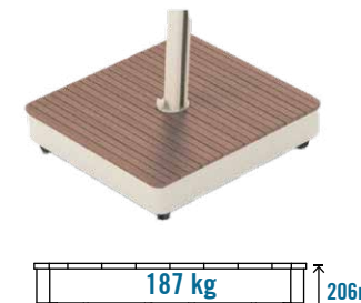
Sand Galvanised steel, powder coated. Limestone Beige, wooden cover Sipo Mahogany Hardwood.